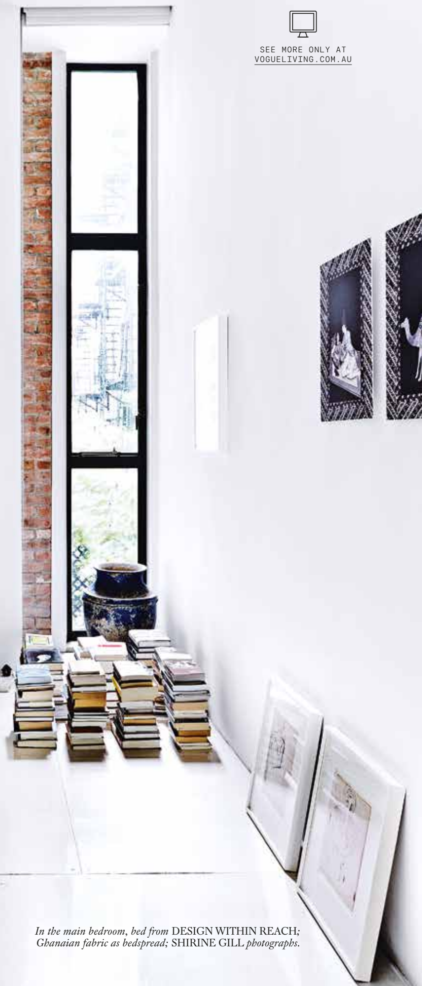
In the main bedroom, bed from DESIGN WITHIN REACH; Gbanaian fabric as bedspread; SHIRINE GILL photographs.